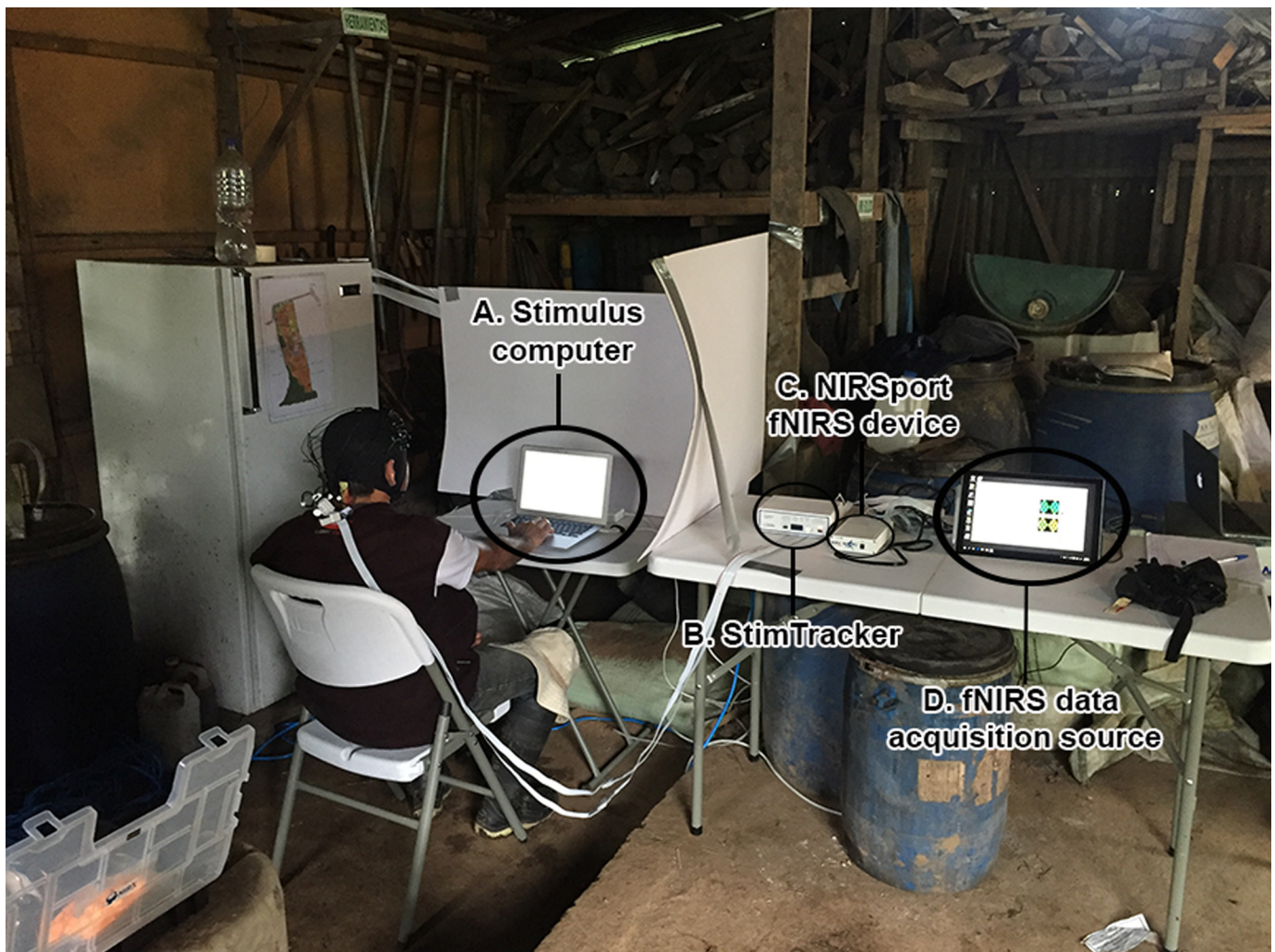
Figure 1. Participant engaged in a computer-based functional near-infrared spectroscopy (fNIRS) task in Costa Rica. Here, an equipment shed is used as the scan location. Because of activity outside of the shelter (off photo right), we chose to occlude the participant's vision in that direction with the use of poster board. In the photo, the pertinent equipment needed to conduct a mobile computer-based fNIRS study has been labeled.